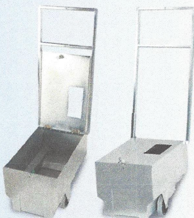
Trolley opened / closed