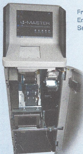
Front Emptying / Servicing