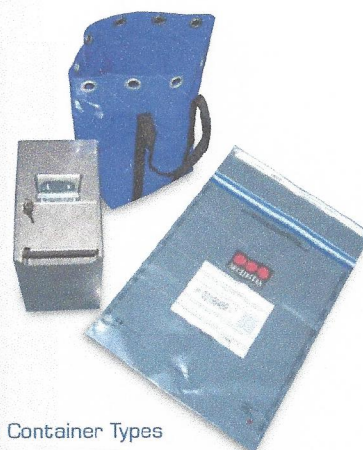
Coin filling Container Types